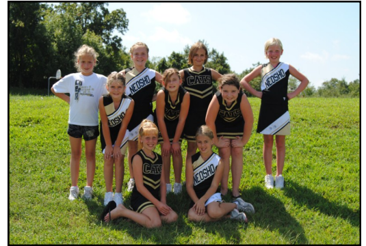
Cheer for Neosho, Wildcats victory. Proudly we sing for our Wildcat team