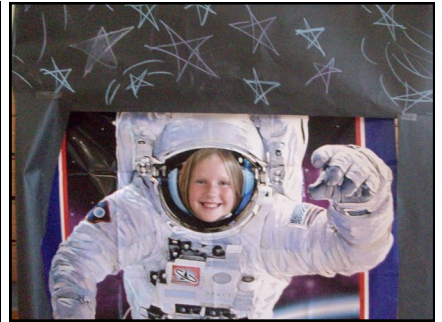
Black and Gold and White,