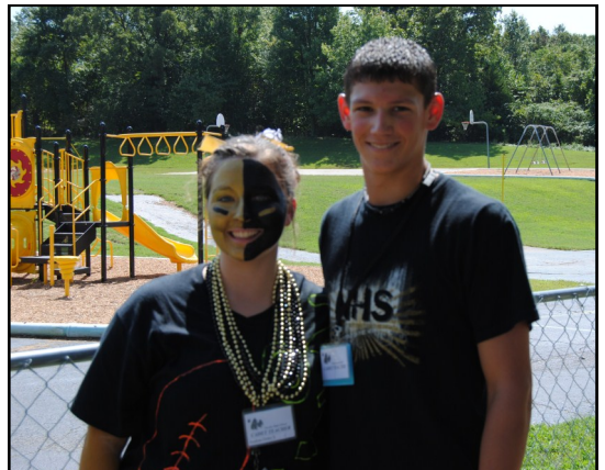
Go Neosho black and gold! GO!